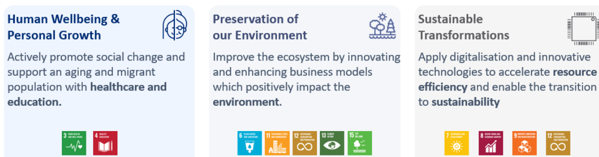
Figure 1: Strategic Impact Objectives